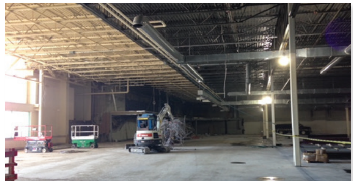
Redevelopment of vacant "big box" and warehouse properties nationwide.