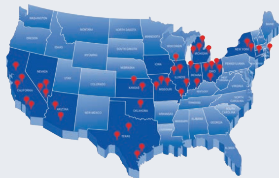
Existing and In-Progress Nationwide Redevelopment Projects